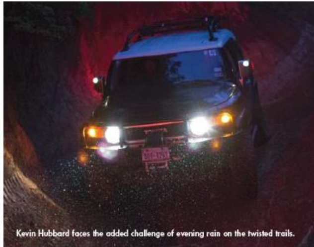
Kevin Hubbard faces the added challenge of evening rain on the twisted trails.

If your trail ride highlighted an accessory needed for your rig, vendors were on hand with an array of essential products. Friday night was the vendor meet-and-greet taco dinner, where products were on full display. Or you could try your luck Saturday night with the nice collection of raffle prizes, including bumpers, rock sliders, fridges and