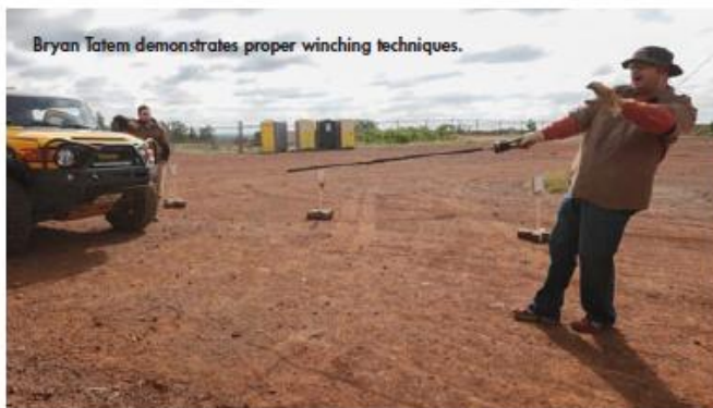
Bryan Tatem demonstrates proper winching techniques.

East Texas is known for scenic hills covered in thick, piney woods—a stark contrast from the remainder of the state. Wildlife is more plentiful in this greener region. Rains occur more frequently. Even the rattlesnakes are a healthier size. Nestled in a valley in the midst of this region is the town of Gilmer. Head northeast and uphill from Gilmer for about six miles and you'll find Barnwell Mountain Recreation Area (BMRA), located on one of the taller hills in the vicinity. This 1,850 acre off-road park is a four-wheel drive wonderland, with a vast network of trails—and every trailhead looks inviting. BMRA features electrical RV hookups, showers and restrooms with real plumbing, a pavilion area for gatherings and numerous campgrounds—the perfect setup for the annual Lone Star Toyota Jamboree.