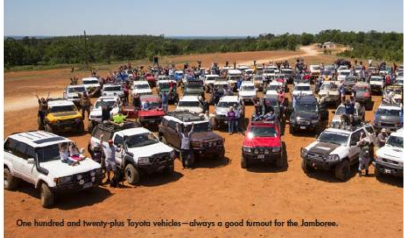
One hundred and twenty-plus Toyota vehicles—always a good turnout for the Jamboree.