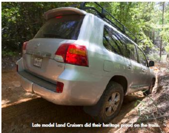
Late model Land Cruisers did their heritage proud on the trails.

East Texas is known for scenic hills covered in thick, piney woods—a stark contrast from the remainder of the state. Wildlife is more plentiful in this greener region. Rains occur more frequently. Even the rattlesnakes are a healthier size. Nestled in a valley in the midst of this region is the town of Gilmer. Head northeast and uphill from Gilmer for about six miles and you'll find Barnwell Mountain Recreation Area (BMRA), located on one of the taller hills in the vicinity. This 1,850 acre off-road park is a four-wheel drive wonderland, with a vast network of trails—and every trailhead looks inviting. BMRA features electrical RV hookups, showers and restrooms with real plumbing, a pavilion area for gatherings and numerous campgrounds—the perfect setup for the annual Lone Star Toyota Jamboree.