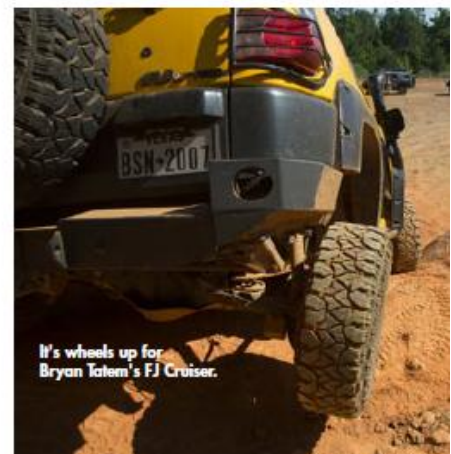
It's wheels up for Bryan Tatem's FJ Cruiser.